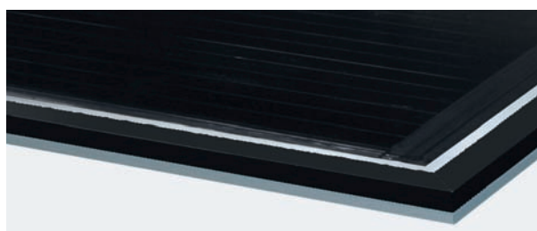
Active and effective vapour barrier prior to lamination process