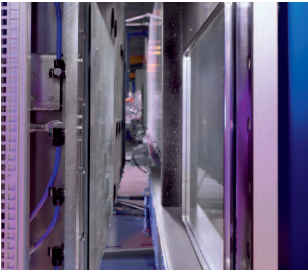
Rectangular format inside the press robot